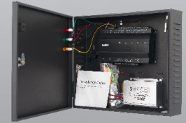
InBio-460 Package B

InBio series is an IP-based biometric access control controller with versatile and flexible functions and it is highly favored in the medium access control management projects with security requirements.